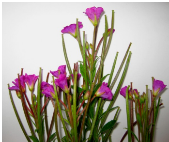
Great Willow Herb