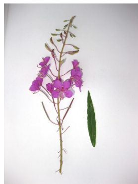
Rosebay Willow Herb